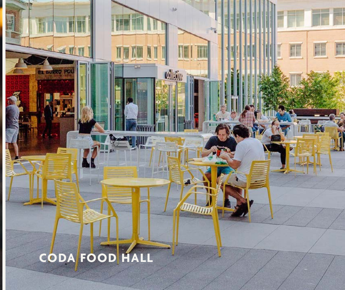
CODA FOOD HALL