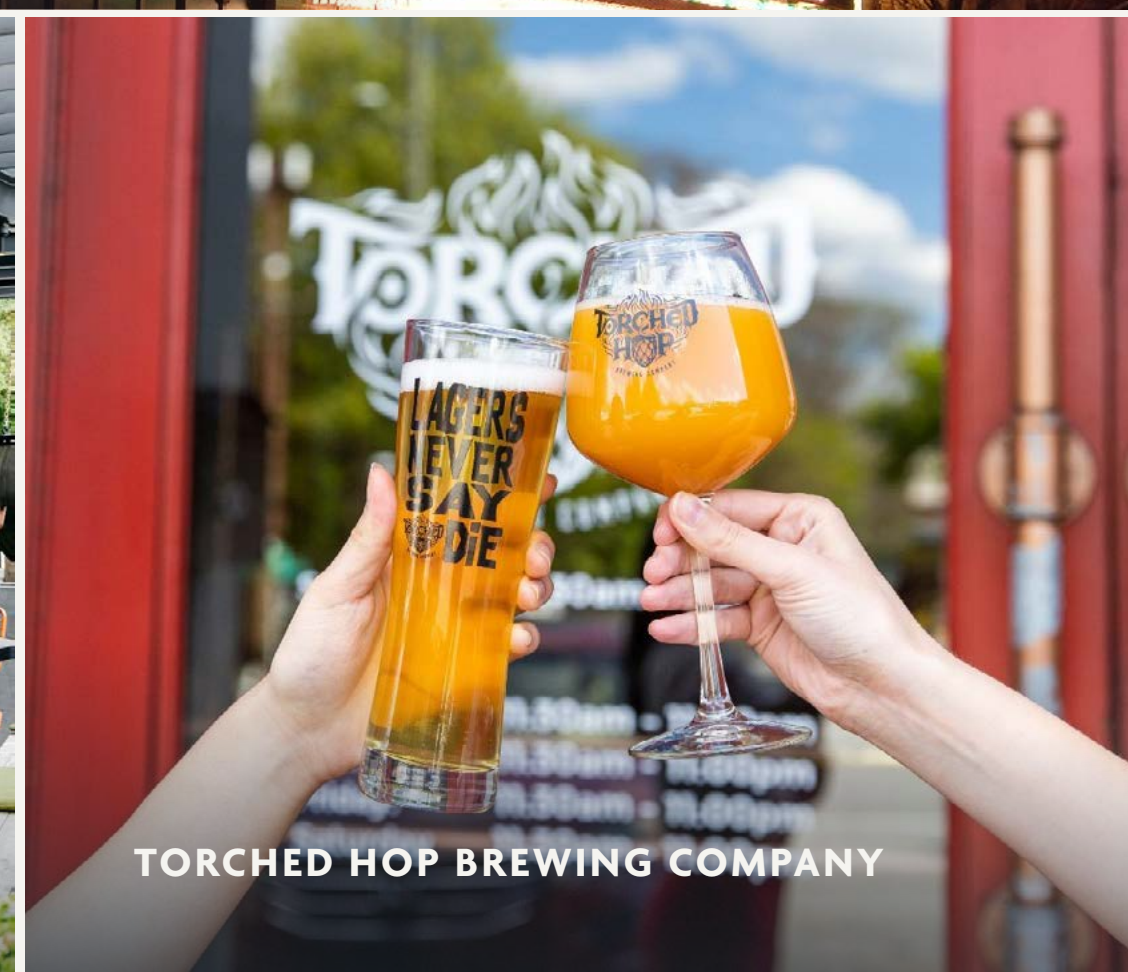
TORCHED HOP BREWING COMPANY