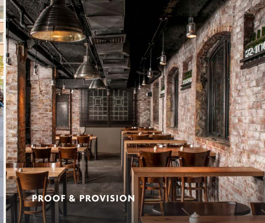
PROOF & PROVISION