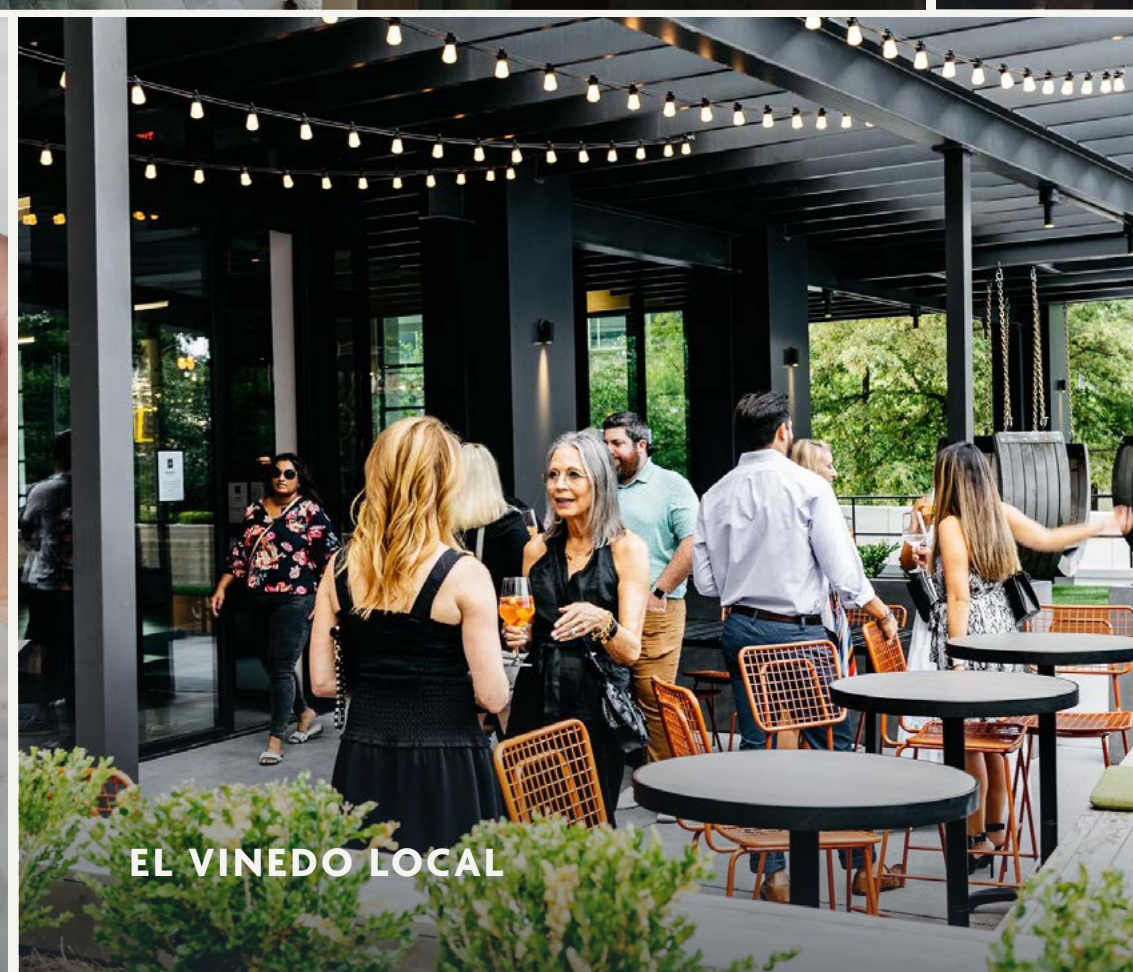
EL VINEDO LOCAL